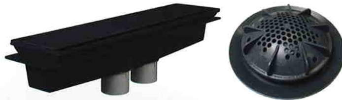
AVSC AND PDR 2 MAIN DRAINS

AVSC and PDR 2 Main Drains — Whether you choose the unblockable AVSC Main Drain or the PDR, you'll rest easy knowing that you've installed the only VGB compliant Safety Drains engineered for heavy debris removal and certified by NSF International. What's more, when you combine the use of our Main Drains with EcoSkim and the MagnaSweep vforce in-floor cleaning system, you will have installed the most powerful tandem of top-to-bottom cleaning products available today.